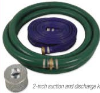
2-inch suction and discharge kit, 70-0524

1 year Mi-T-M engine ♦ 2 year pump ♦ 3 year Honda engine