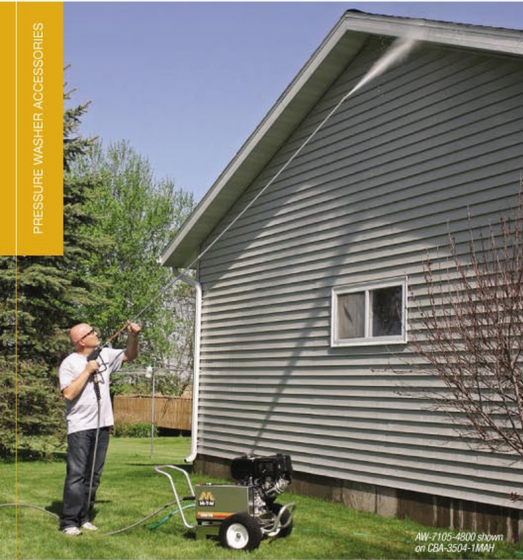
AW-7105-4800 shown on CBA-3504-1MAH