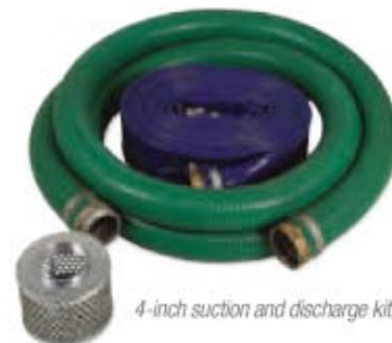
4-inch suction and discharge kit, 70-0661