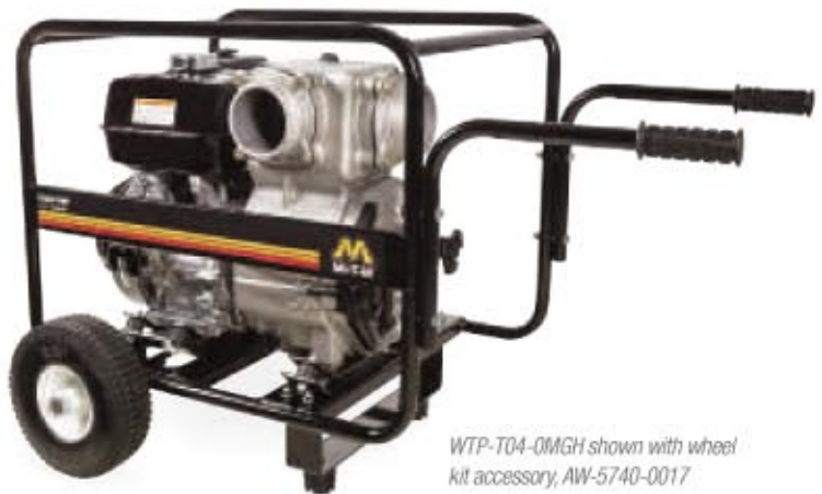
WTP-T04-OMGH shown with wheel kit accessory, AW-5740-0017